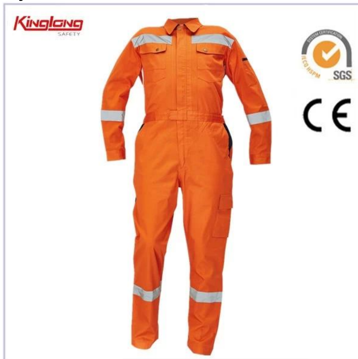
Imagem do Produto