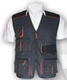
WH280 Emerton Vest 65%polyester, 35% cotton canvas Oxford fabric reinforcement High quality