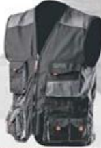
WH290 Vest 65% polyester 35% cotton High quality