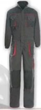
WH280 Emerton Pants 65%polyester, 35% cotton canvas Oxford fabric reinforcement High quality