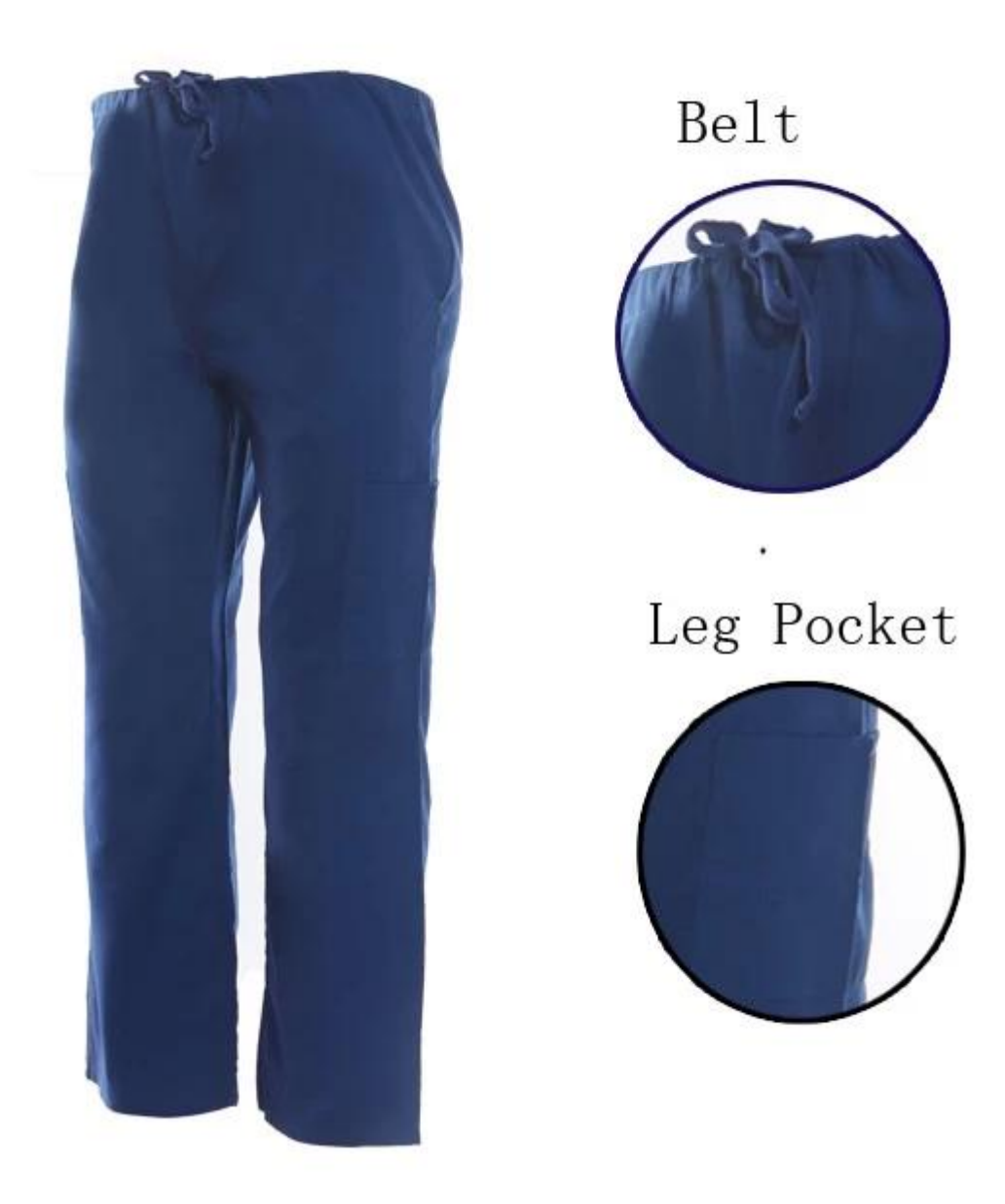
More Related Products For You To Choose: