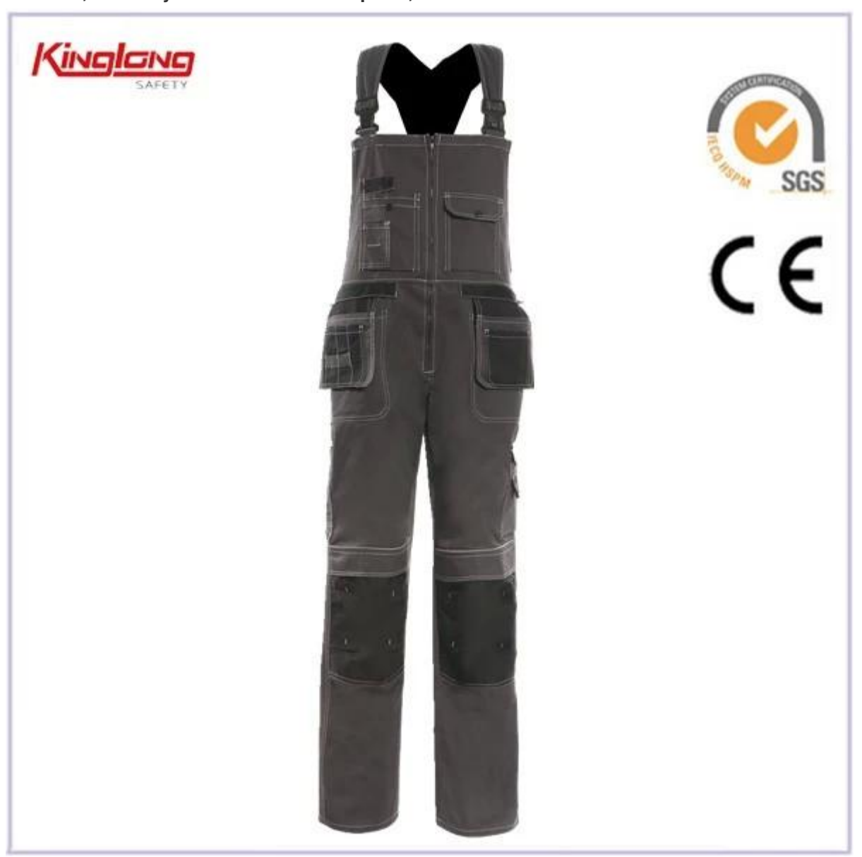
Bib Pants, 80% Polyester 20% Cotton Bib pants, Knee Pad Function Bib Pants