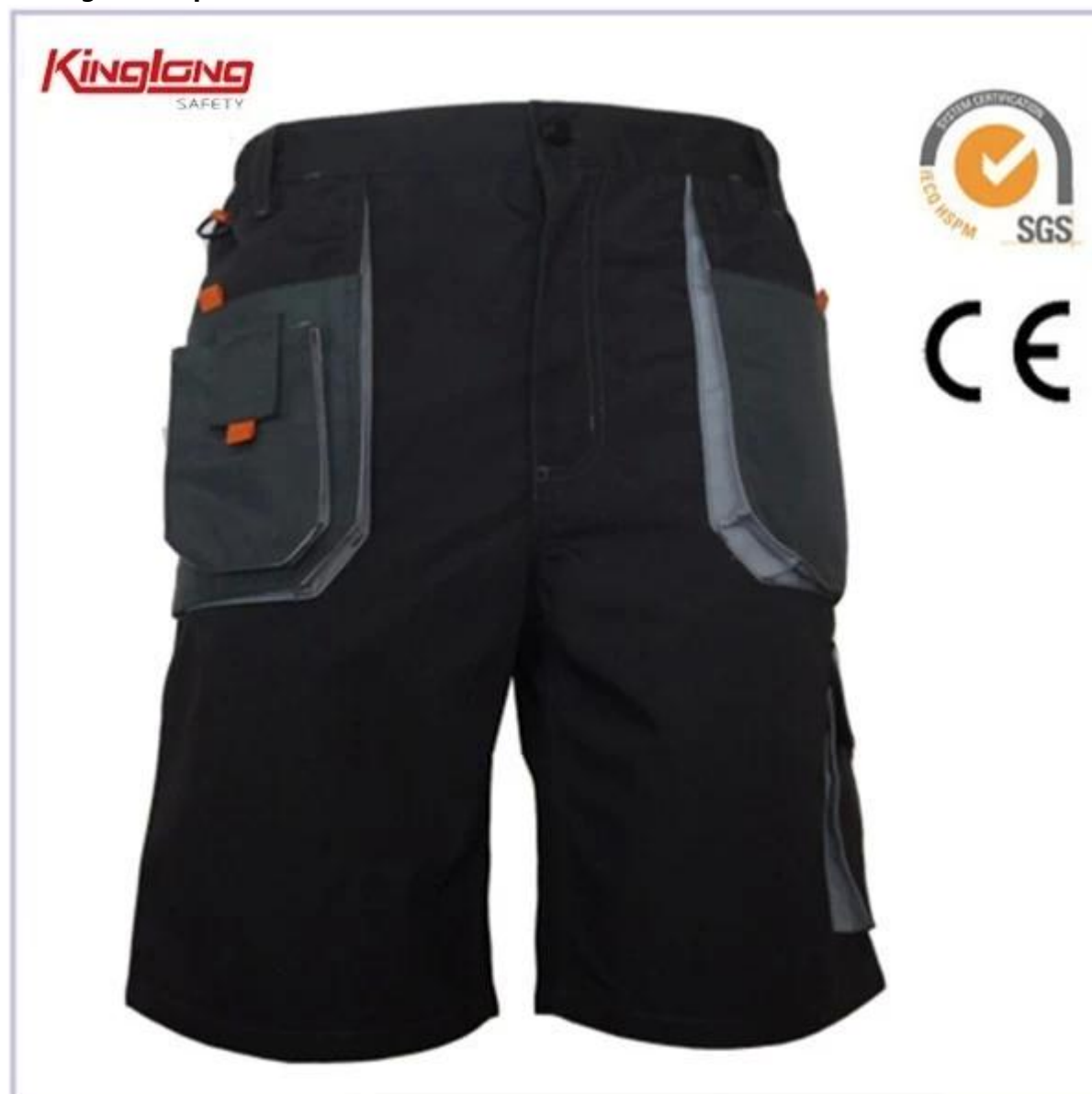
Immagine del prodotto