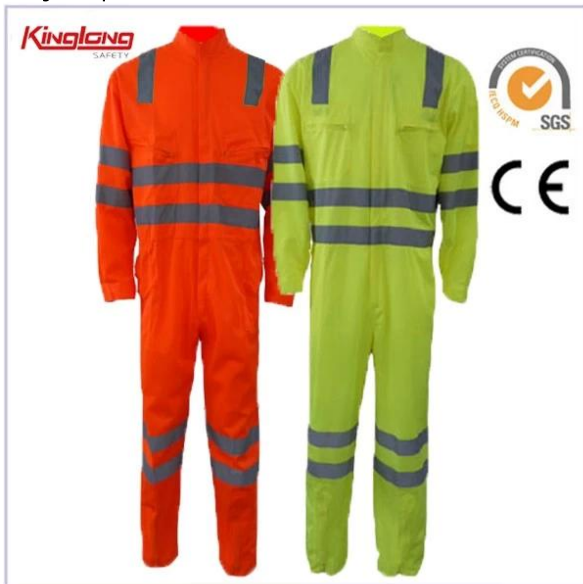
Immagine del prodotto