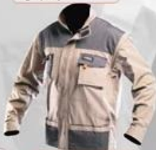
WH290B Jacket 100% cotton High quality