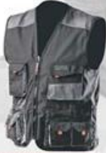
WH290 Vest 65% polyester 35% cotton High quality