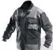
WH290A Jacket 65% polyester 35% cotton High quality