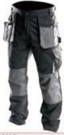
WH290 Pants 65% polyester 35% cotton High quality