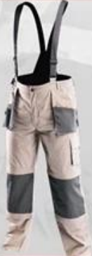
WH290B Bibpants 100% cotton High quality