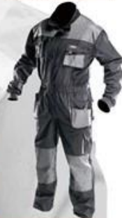
WH290 Coverall 65% polyester 35% cotton High quality