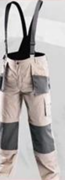
WH290B Bibpants 100% cotton High quality