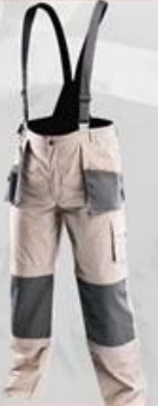
WH290B Bibpants 100% cotton High quality