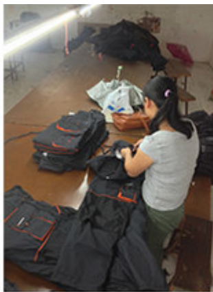
3 Clean up the thread